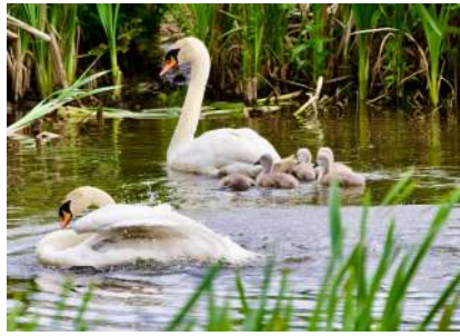
Swans and Signets