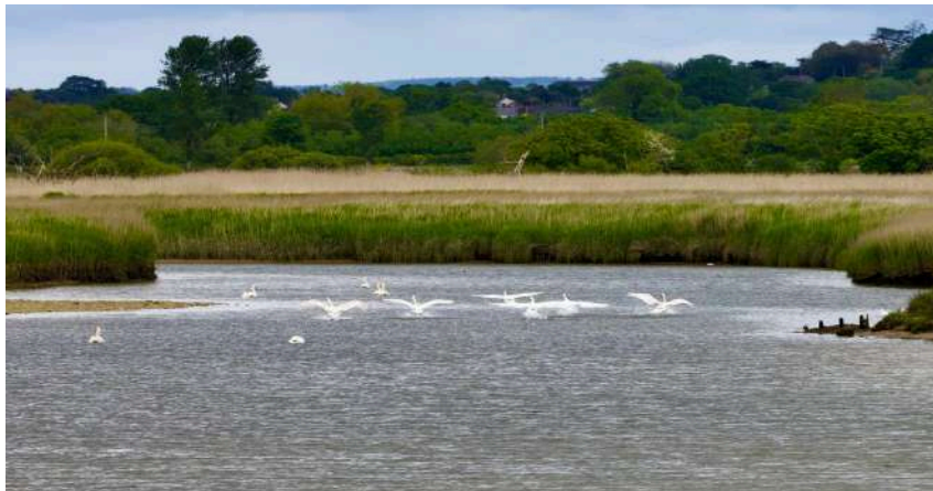
Swans Landing at Seaton Wetlands